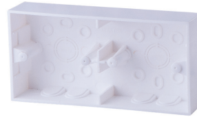
Twin Sunk Box