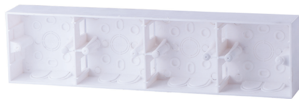
4 Way Sunk Box