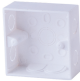
Single Sunk Box